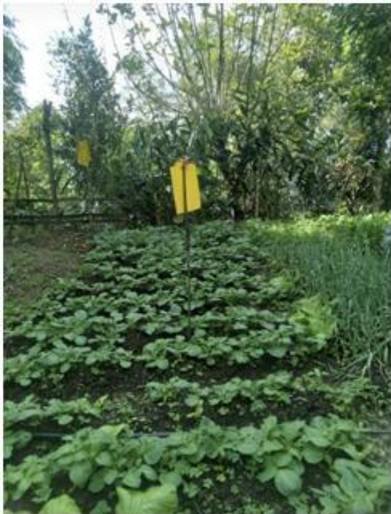
Potato crop after one month of sowing installed with yellow sticky traps.